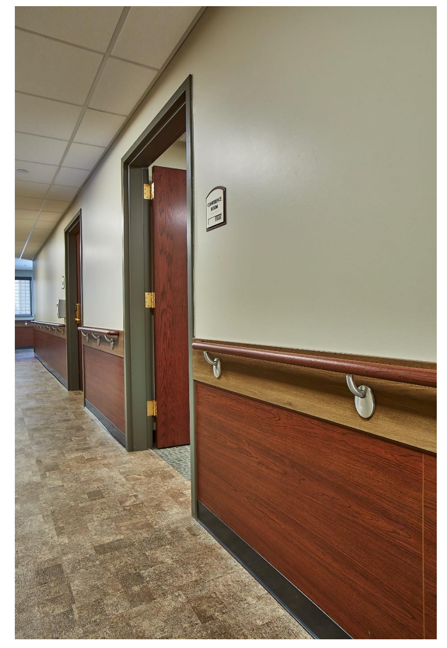
Rigid sheet wall panels are designed for wall protection and decoration.