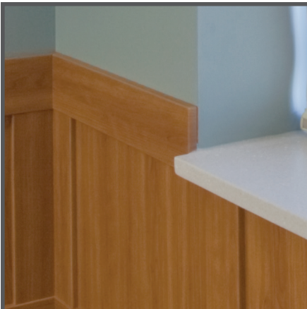
Factory Finished Edge