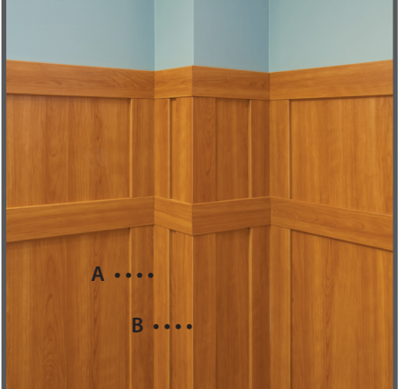
A. Inside Corner | B. Outside Corner