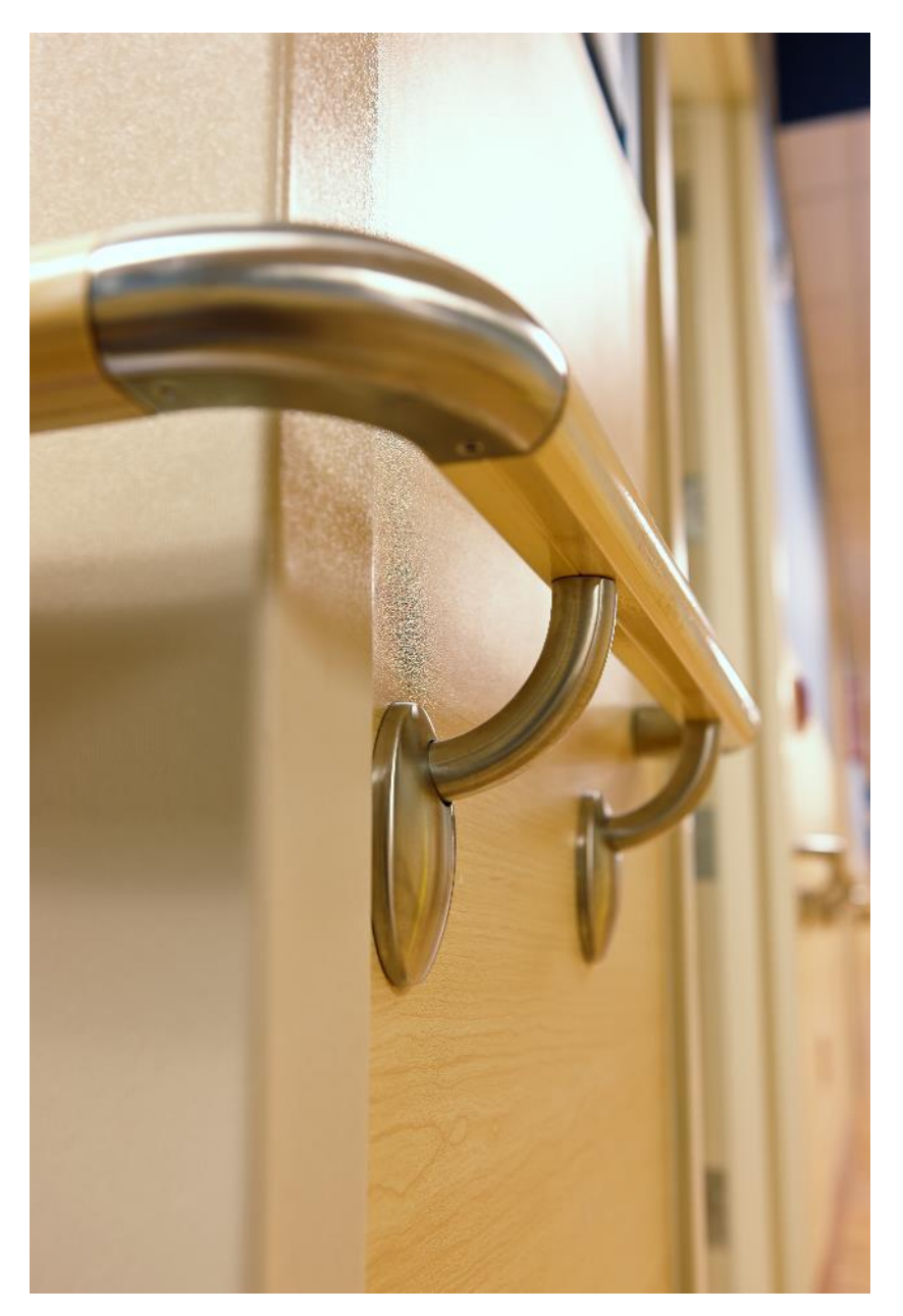
Handrail systems are designed for wall protection and decoration.