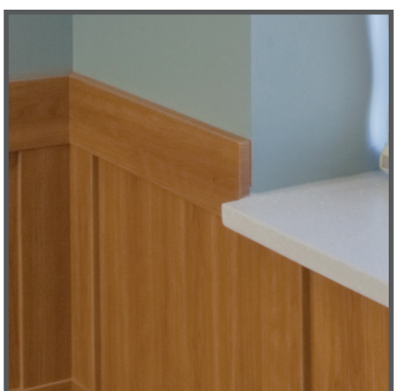
Factory Finished Edge