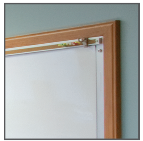
Accent Trim Pieces