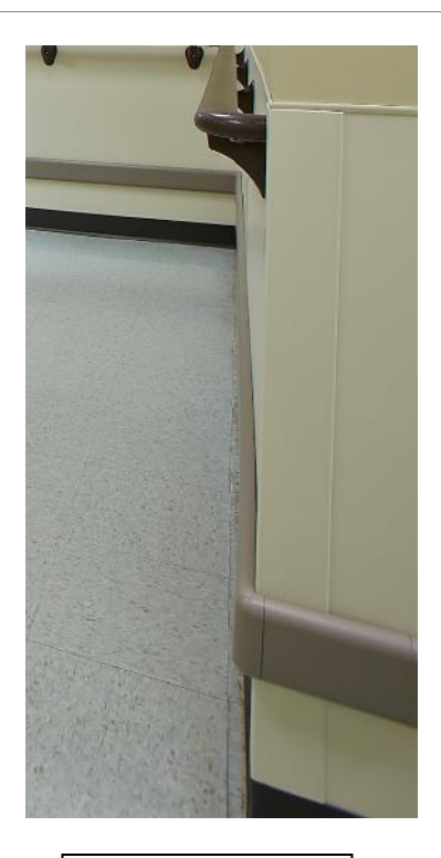
Tape On Corner Guard