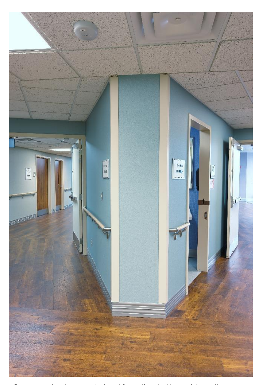
Corner guard systems are designed for wall protection and decoration.