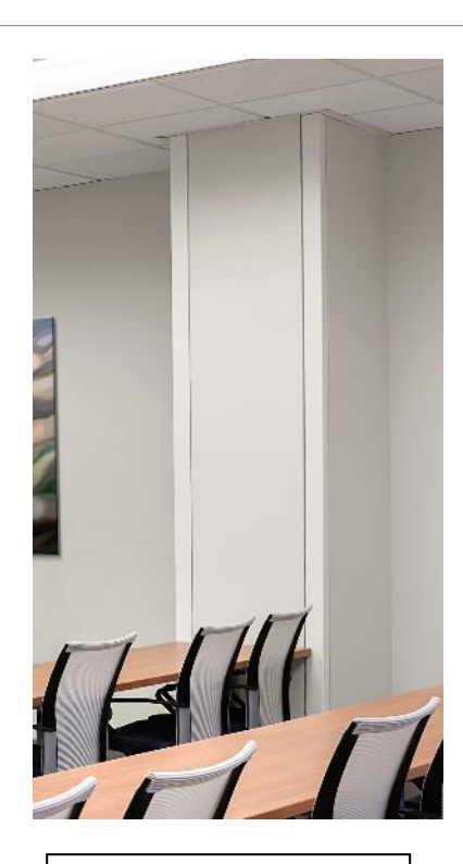
Flush Mount Corner Guard