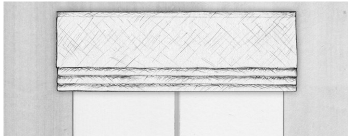
STATIONARY ROMAN 14" Standard Length Not launderable - Affixed to board