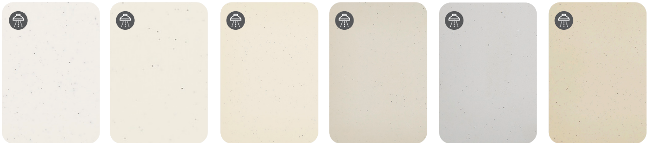
Frosted White | A1 Arid | A1 Haven | A1 Quarry | A1 Dusk | A1 Wool | A1