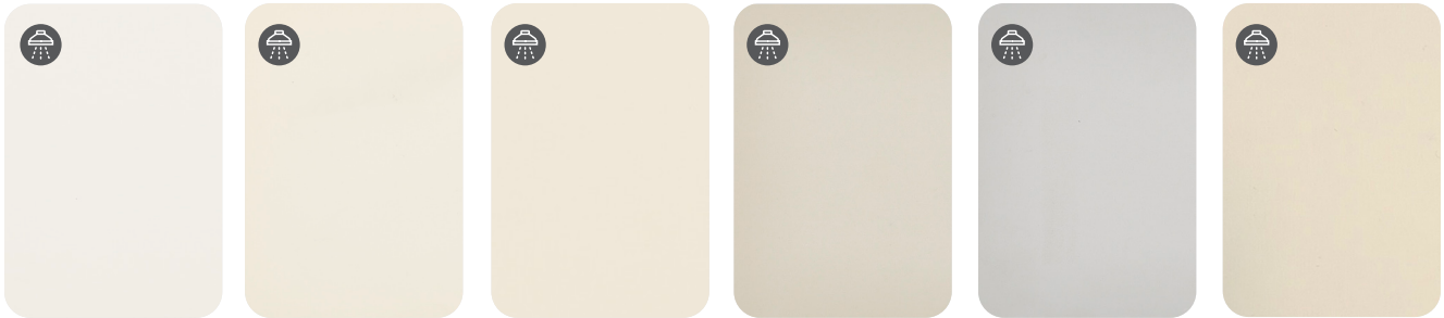
Bright White | A White Sand | A Antique White | A Taupe | A Shadow | A Bone | A