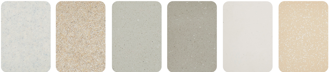
Breeze | B Dolomite | B Stratus | B Rasinstorm | B Nova | B Risotto | B