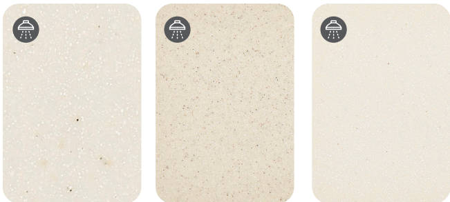
Natural Linen | B Sandbar | B Candlelight | B